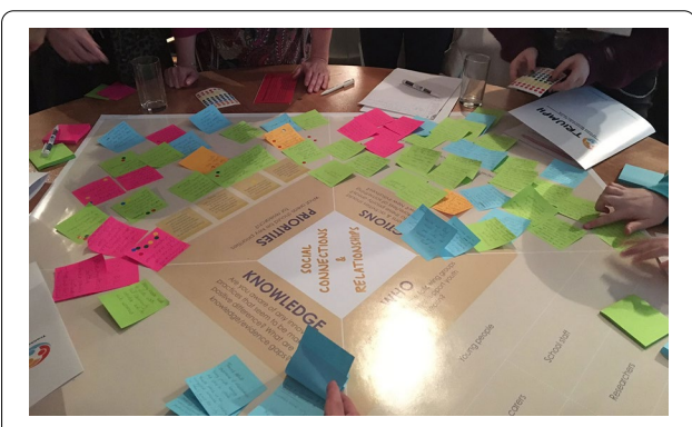
Fig. 2 Example of workshop attendees capturing discussions using the conversation template

The main workshop session followed a similar format to the YAG workshop. Tables were organized by thematic area, and each participant was involved in discussions for two thematic areas (of their choice and relevant to their experience), which lasted approximately 1 hour each. Each table discussion was led by a facilitator (typically a theme lead) and supported by a dedicated Post-it Note-taker, and an updated version of the YAG workshop conversation template was used to guide the discussion (see Fig. 1, right and Fig. 2). The template was divided into four sections with the following key questions: Knowledge—of innovative practices that are making a