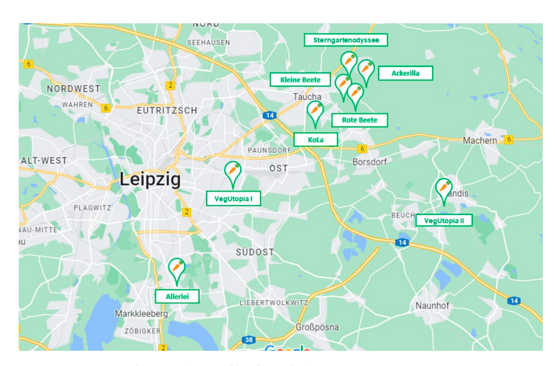
Figure 1. CSAs around Leipzig (mapped by the author).

In Wales, three CSAs on the Gower peninsula near Swansea engage in enhanced local collaboration as well (see Figure 2). The already well-established 'Cae Tân' is particularly active in training and supporting other Welsh CSAs [33], even helping some of its own growers start their own initiatives close by. The cooperative 'Coed Organic' also received some support from Cae Tan when starting up, but due to being located 50 km outside the Gower, its regular collaboration partners are other nearby farms and food platforms. Similarly, in the absence of any nearby CSAs, 'Orchard Acre Market Garden' in Abergavenny works primarily with nearby organic farms and associations working on sustainability. They also take part in the local 'Our Food' network, a project similar to Allmende Taucha in Leipzig, which supports local sustainable food production and consumption.