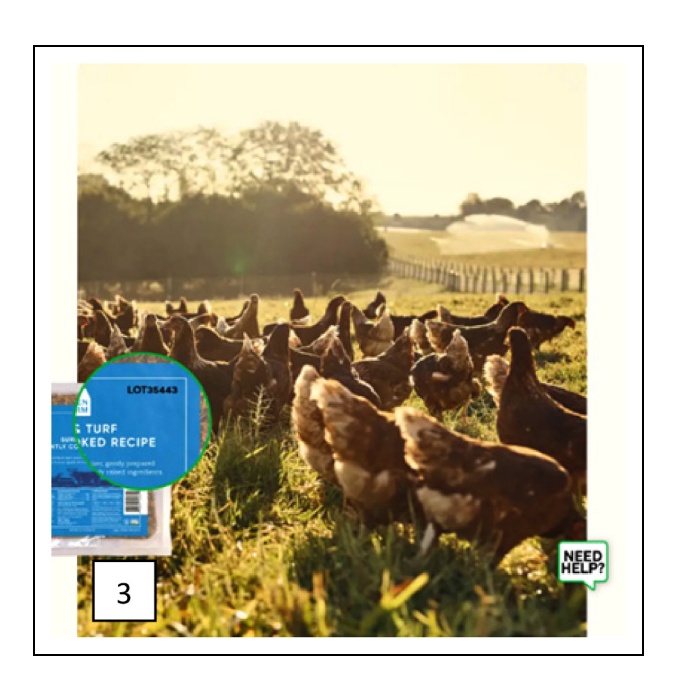
Figure 3. Screenshot of the Open Farm transparency page (2022).

do not require any daily outdoor access until step four. Inside, chickens have a 'maximum stocking density' of six pounds per square foot (GAP Standards, 2022: 4.6.2) with one enrichment<sup>2</sup> per 1000 square feet (GAP Standard, 2022: 4.8.5). The target weight for the chicken at slaughter is seven pounds, which means that chickens must only have a minimum of roughly one square foot per bird and there could be up to 1000 birds for every one enrichment item (Mandell et al., 2020). Since GAP defines access to enrichment as a key aspect of animal welfare and humane handling, even when the guidelines require better living conditions, it is not guaranteed that it will be achieved due to the ratio of bird-to-enrichment item. Finally, during this research in August 2021, undercover footage of one GAP facility – Plainville Farms – showed turkeys being kicked, beaten with rods, and stomped on while being loaded up for slaughter (PETA, 2021). So even though GAP audits every farm every 15 months and claims humane handling, there is plenty of time and lack of oversight to prevent cruelty from happening in places where animals are made killable.