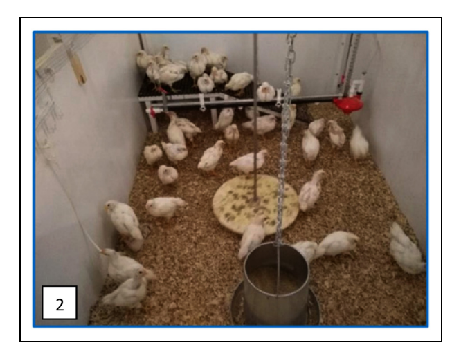
Figure 2. Image from the 'Better Chicken Project' (Mandell et al., 2020).

However, the standards of humane handling are misrepresented and the images of chickens in fields do not actually represent the conditions permitted by the standards. For example, chickens