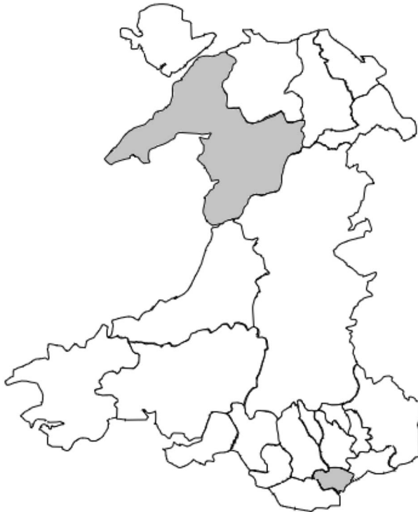
Figure 1. Map of counties in Wales with Gwynedd (at north) and Cardiff (at south) in gray.

The project targeted two areas of Wales: Gwynedd in the north and Cardiff in the south (Figure 1). Gwynedd is generally perceived to be part of the Welsh-speaking “heartlands” (Coupland, 2012), with 64% of people in the area reporting that they are able to speak Welsh (Welsh Government, 2022). Cardiff is the capital city of Wales and is a densely populated metropolitan area. The proportion of Welsh speakers in Cardiff is lower than the national average due to different patterns of language shift across Wales. The Census results for Wales showed that 18% of the country’s population were