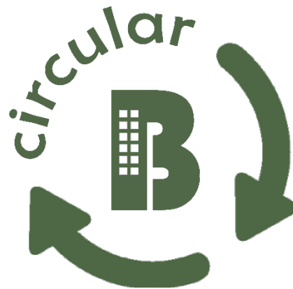
Figure 4: The Action's Logo