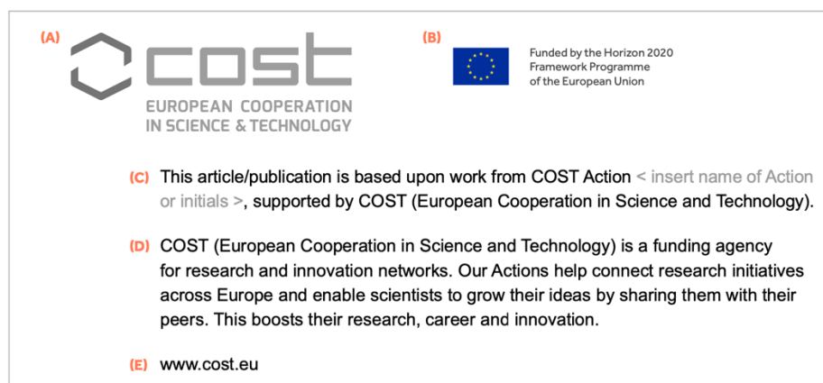
Figure 2: Requirements when acknowledging COST Office funding 2

* The COST logo should never be embedded throughout an entire video, only insert it at the beginning or the end