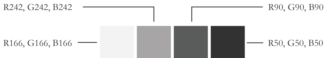
Figure 6: Visual identity for greyscale documents

Besides, a complementary grey-scale palette was chosen, providing more four neutral grey colours for more variety and interaction without comprising the visual identity established using main palette's colours.