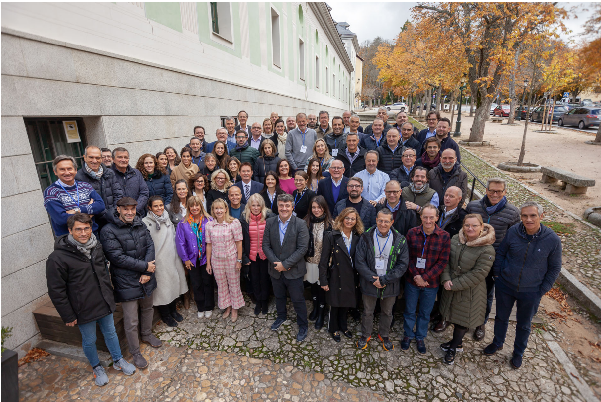
PHOTOGRAPH 1 Workshop participants during the in-person meeting in La Granja de San Ildefonso, Segovia, Spain.