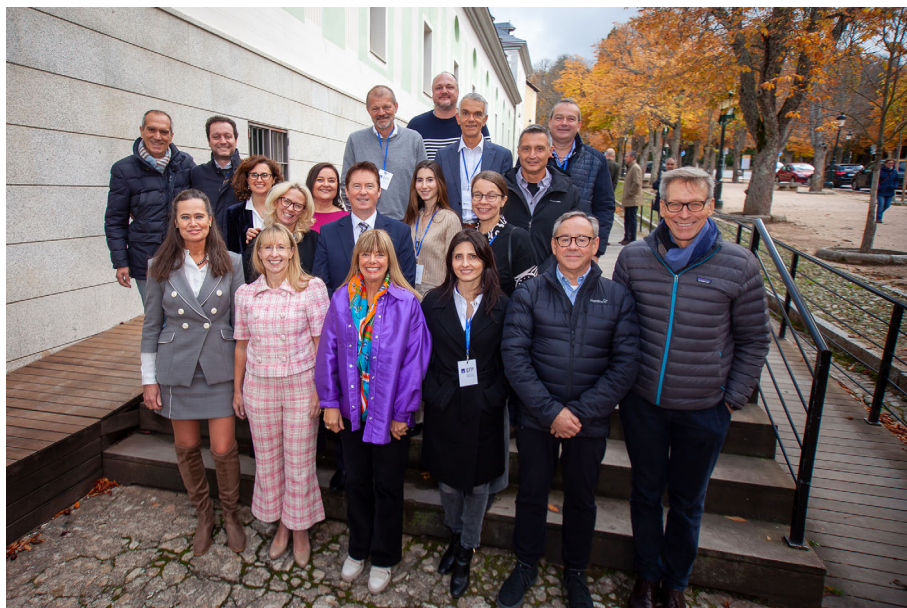
PHOTOGRAPH 2a Workshop participants in Working Group 1.

Abbreviations: EFP, European Federation of Periodontology; UCM, University Complutense of Madrid.