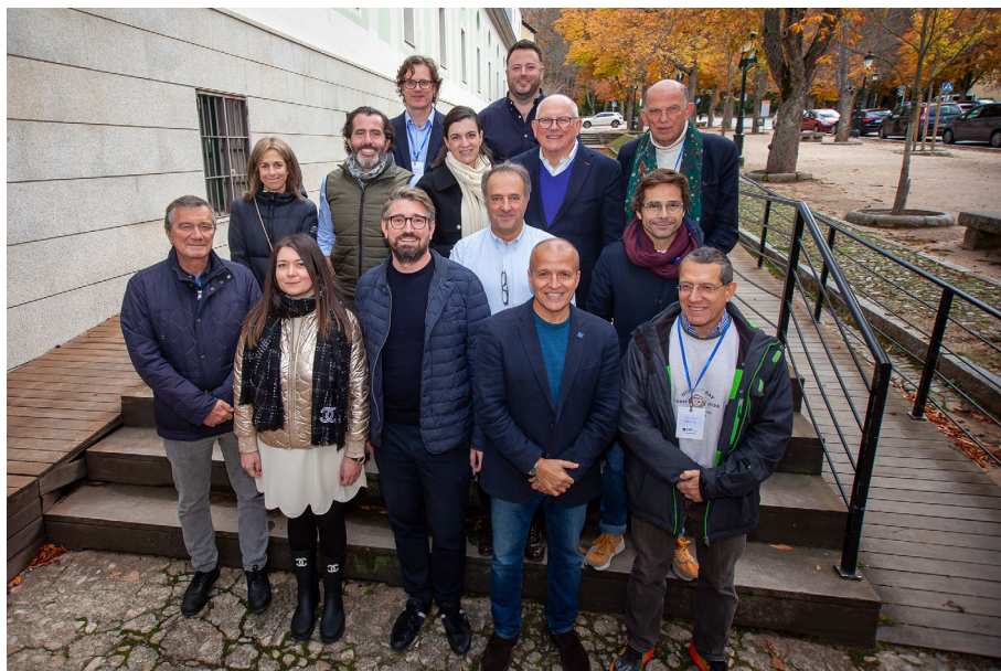
PHOTOGRAPH 2c Workshop participants in Working Group 3.