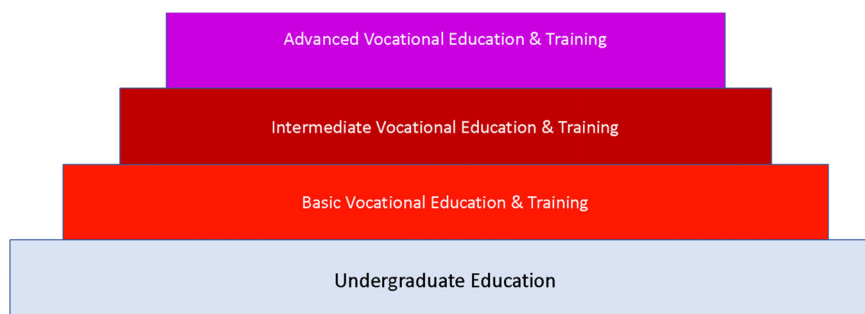
FIGURE 2 Escalator structure of vocational education and training (VET) in periodontology. For dentists with a special interest in periodontology, the consensus report envisioned three different steps building on each other in an escalator model: the steps of the VET escalator include a basic (at least 20 ECTS/ECVET), a further (at least 40 ECTS/ECVET) and an advanced level (at least 60 ECTS/ECVET) on level 7 of the EQF. These are often represented by the academic degrees of Postgraduate Certificate (PGCert), Postgraduate Diploma (PGDipl) and Master of Science (MSc), respectively.

et al., 2024) and build upon those. The learning outcomes for specialist education (Goldstein et al., 2024) are significantly broader than those and are not directly mapped.