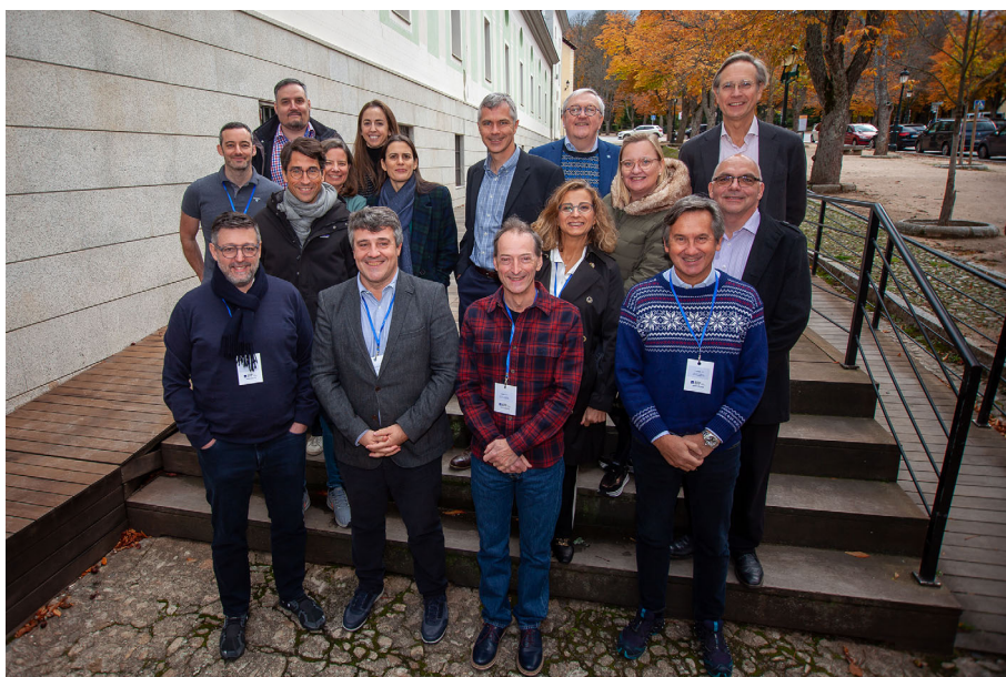
PHOTOGRAPH 2d Workshop participants in Working Group 4.