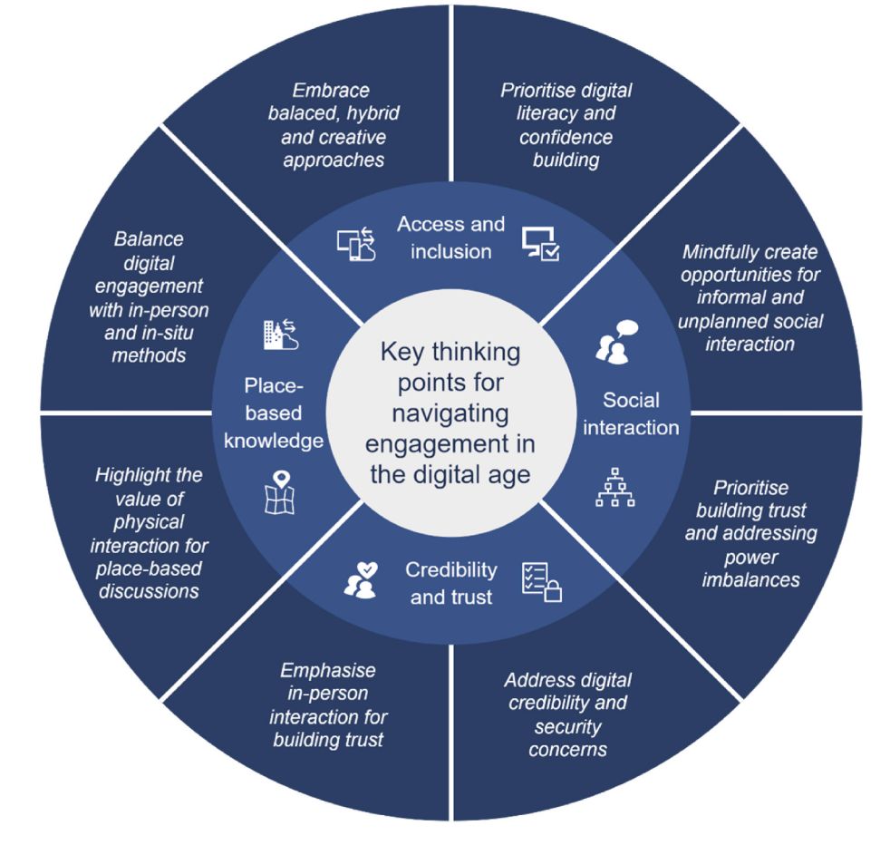
Fig. 2. Recommendations for environmental practitioners: Key thinking points for navigating engagement in the digital age.