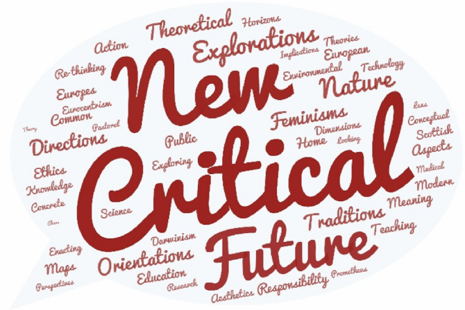
(2) 1991–2000 n = 50 of 64 words | 78% Geography 18 | 28% in 40 session titles Geographies 11 | 17%