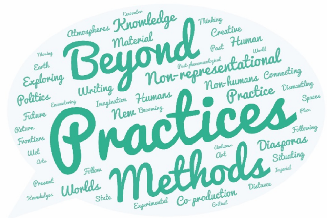
(4) 2011–2021 n = 50 of 342 words | 15% Geography 32 | 9% in 131 session titles Geographies 37 | 11%

Methodological note: Displayed are the Top 50 most used words in HPGTWP/HPGSG/HPGRG conference session titles (including subtitles) after excluding common words by WordArt.com and the key terms from the group's changing titles and their variants: Geographical Thought, History, Philosophy, Geography. Provided are the frequencies of Geography (the most used word) and Geographies (second in 1991–2000).