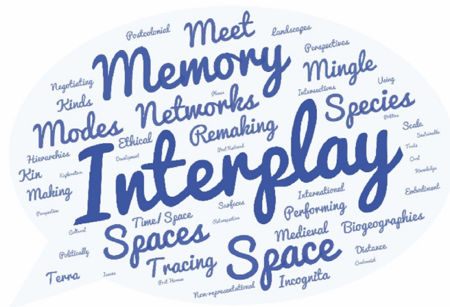
(3) 2001–2010 n = 50 of 125 words | 40% Geography 16 | 13% in 85 session titles Geographies 21 | 17%