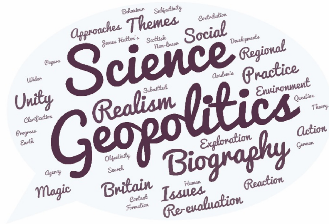
(1) 1981–1990 n = 41 of 47 words | 87% Geography 14 | 30% in 30 session titles Geographies 0