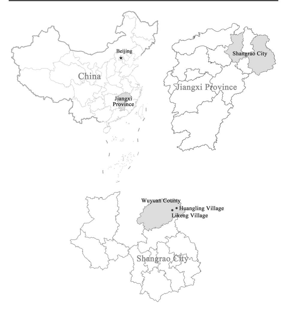
Fig. 2 Location map of case sites.

both 2019 and 2020. The main data collected and analysed for this research are from two sources. The first source is semi-structured interviews. We operated observation of CFC in Huangling Village and Likeng Village whilst carrying out in-depth interviews in which we asked different stakeholders to list the key outcomes, different partners involved in the process of the CFC and governance, and the impacts of CFC from their perspectives. The researchers have also visited the governments of Wuyuan County, Jiangwan Township, and Qiukou Township to conduct in-depth interviews with government leaders and officials in charge of these CFC initiatives. In this research, 6 government officials, 6 village committee leaders, 4 enterprise leaders, and 12 villagers were interviewed. The interviews were arranged between 30 min and 2 h depending upon the availability of interviewees. The second sources of data and information were the official documents collected during the survey,