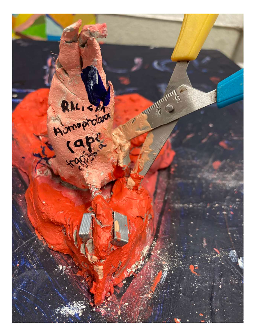
Figure 2. Bruised heART.

on creating a platform for LGBTQ+ youth voice – a powerful moment, we later learn, in a school yet to form an LGBTQ+ group for its growing LGBTQ+ population. Inspired by the book, they ask for black and multi-coloured feathers, masks, paint, gold drawing pins and glitter. Kae's mask is painted black and sports a multi-coloured feathered mohawk, graffitied with their favourite phrases from the book: 'Flamingos fighting look just like kissing', 'Some men have vaginas', 'Barbies and Belongings', 'I want to be fierce', 'Drag', 'I don't feel queer enough' and 'The Black Flamingo'. Max's mask is painted deep pink with blackened eyes and sprouts horns made from sparkly pipe-cleaners. Max also designs a third mask. The outside is covered with LGBTQ+ symbols. Pejorative and oppressive statements populate the inside. As the masks take shape, a clay pillow is also in the making. They paint it bright red, pierce it with gold drawing pins and glue