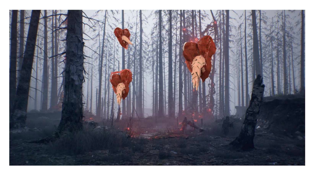
Figure 6. Thorned heARTs.

river, and the volume of the beating heart, cries, and chatter increases. The final line, 'you'll find me there waiting', screens multiple slashed-tongued hearts pierced on the thorned branches of the forest trees (Figure 6). The film then cuts to close-ups of the dartaphact, the screwed and slashed tongue protruding from a red heart with the perpetrating scissors stuck inside, and the headline, 'Fuck Society' and the words 'transphobia, racism, homophobia, rape' in full view. The film draws to a close with an audio-visual crescendo in which the clay grey heart, still beating but seizure-like, drained of colour, hovers hauntingly in the middle of an apocalyptic scene where forest trees are blazoned with embers and rooted in a bloody bed of red. The final frame cuts to a forged heart, now enflamed, and slowly burning to the sounds of post-industrial hammering (Figure 7). The heartbeat fades away, and viewers are returned to the forest and forest sounds, but with a chink of light lurking in the distance.