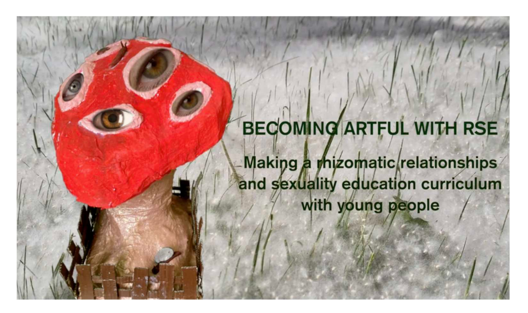
Figure 4. A rhizomatic RSE.

be enlivened through sound, and then movement. Some young people invited our artists to respond in ways that captured how their dartaphacts affected them in the making process. For example, Aiza directed Rowan to create the 'sounds of the chant, Free Palestine' and 'sounds of flags flowing in the air'. She also gave Heloise a free rein on how to work with the flag footage. The only steer was for fluidity and movement in the flag (see https://vimeo.com/829053226). Meanwhile, Kae and Max had a simple direction for Heloise to make their 'feathers sway' and create close-up shots of the pinned pillow and masks. Kae was the only young person to use their voice for the soundtrack. Acutely sensitive to the tone and pitch of their voice, the words from their mask are whispered. Kae then invites Rowan to create a soundscape that intersperses the whispers, with flamingos flapping their wings (see https://vimeo.com/829054199).