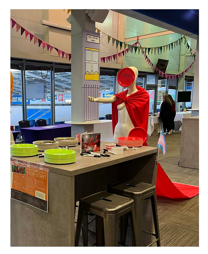
Figure 9. Girls' equality plates fe(a)st.

their messages. The rulers became ruler-skirts and have agitated policy and practice multiple times. They have also been worn by other young people shaking up what matters on a range of gender and sexual equalities issues (see Renold and Timperley 2021).