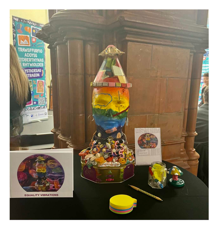
Figure 8. Dartaphacts to intra-act with.

dartaphact) and stated that she liked the idea that there is just a title and image to draw people in: 'It's like the woods... people have to find their own path through what it might mean to them'. The woods became the backdrop for all the pieces and we recycled the jars to collect how some of those meanings might materialize (see Figure 8).