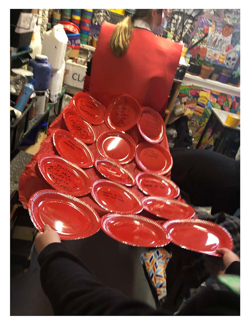
Figure 1. Armour plate cape.

and watching them vibrate as they spin was a vital mattering and an idea that came through in the making. We pick up the notion of feeling sound in the next section.