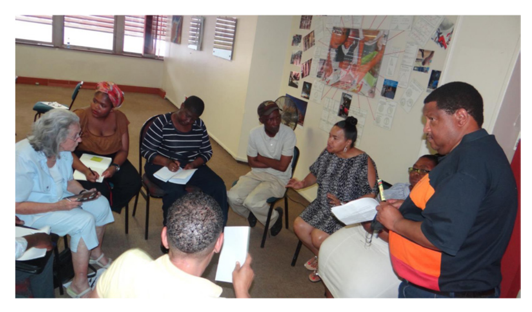
Figure 2: Snapshot of one of one of the breakaway focus group sessions during a cross-neighbourhood stakeholder meeting.

resources they were less dependent on organisations like Planact. For example, in Norwood/Orange Grove, the residents' associations had the capacity and legal power to lobby the City to change height restrictions of buildings. Similarly, in situations where communities are organised, the City was willing to partner and avail resources, for instance by trying to convince the leaders of the Alexandra Taxi Association to become shareholders in the BRT along the Louis Both corridor. The active Greater Sophiatown Development Forum managed to convene a public meeting and invite the JDA (Johannesburg Development Agency, the infrastructure arm of the City of Johannesburg) to come and account for the projects that were implemented in their area. Aside from these organisations that had engaged with the City and CoF, we also tried to pull in those communities and groups along the corridors that had initially been left out of the decision-making process.