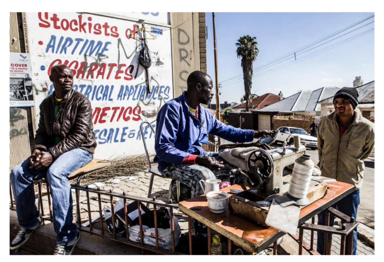
Figure 5: Small tailor business set up along Louis Botha Avenue in Orange Grove. If the Corridors Initiative was geared towards the promotion of mixed-use facilities, there was little indication about a planned integration of informal activities, raising concerns amongst affected groups. PC: Mark Lewis, June 2016.