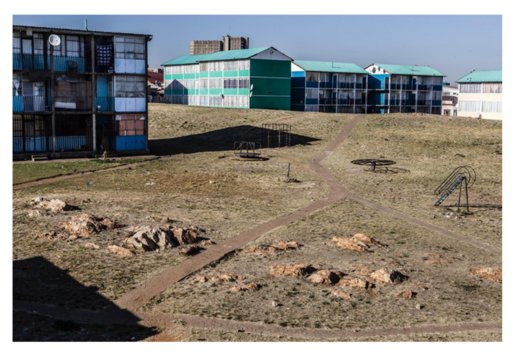
Figure 4: View of pre-existing apartment blocks in a more densely built-up part of Westbury. Within the scope of the Corridors Initiative, plans for the broader area largely focused on upgrading or building new community infrastructure such as clinics, community centres or playgrounds. During visits to the neighbourhood, residents stressed that safety was their main concern and required a more dedicated effort from the state, with gang-related violence undermining the prospect of sustainable economic activities and opportunities. PC: Mark Lewis, July 2016.

The next thing is [...] very little has been touched on in terms of cross-cutting issues; nobody spoke about the integration of schools. We are in an area where there are twelve schools within a three kilometre range. There are over 10,000 [children] in those schools, there is not one proper sports facility. (Westbury resident, focus group, 18 November 2016)