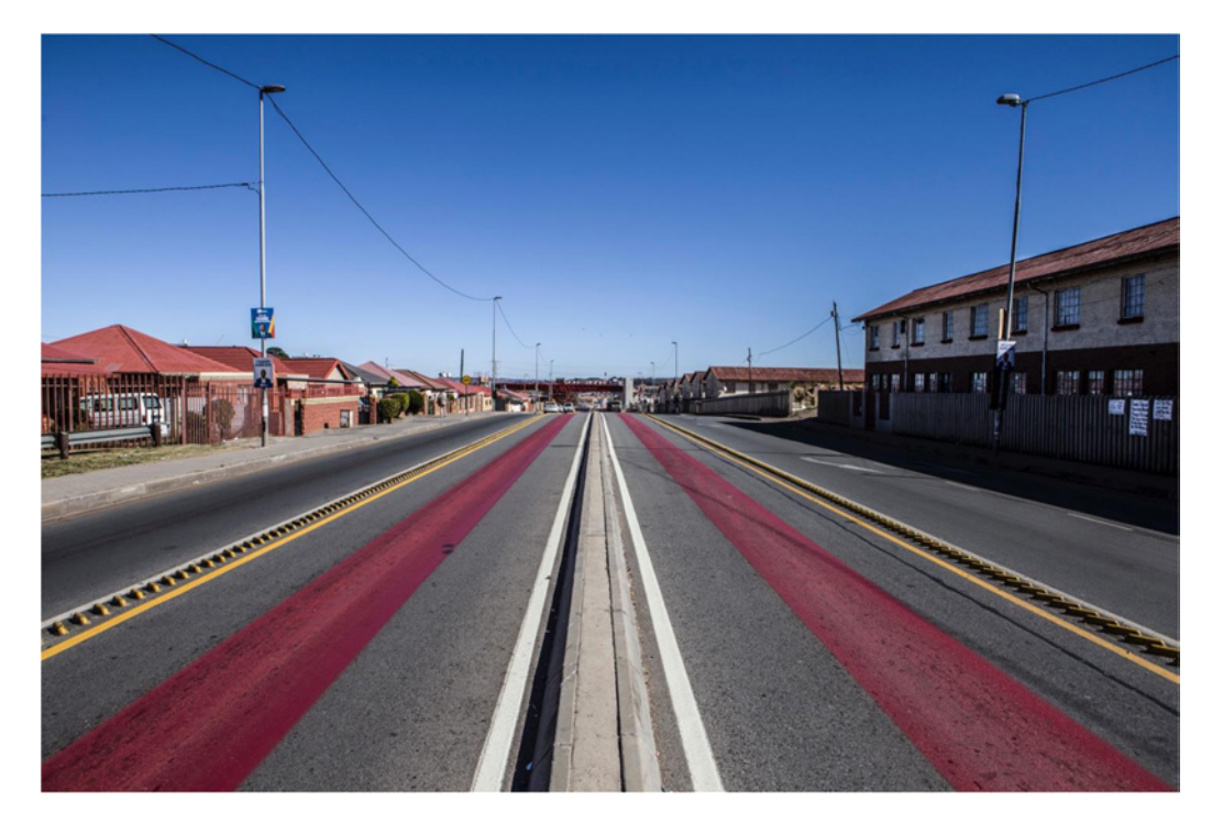
Figure 3: View of the dedicated Rea Vaya bus lane between Coronationville and Westbury along the Empire Perth Development Corridor. In different neighbourhoods where the BRT infrastructure has been rolled out, the concrete island in the middle of the road, stretching for long interrupted distances, has significantly altered mobility patterns and affected local businesses. PC: Mark Lewis, July 2016.

Committee bringing together these divided communities to develop a precinct framework through a participatory process. In this case, not only was the precinct plan not taken into account within the Corridors' planning, but the Corridor introduced a physical divide between these communities (through the development of rapid transport lanes), including making crossing the road to the local school potentially lethal (Focus group discussion, 1 June 2017). Instead of stitching together parts of the city, the project contributed to the increase of spatial and human ruptures in different segments of the Corridors (see Figure 3).