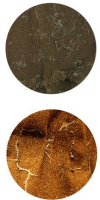
Insect damage on costumes