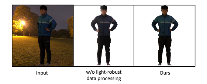
Figure 3: The effectiveness of lighting-robust data processing.

2.2.2 Lighting-robust data processing. Our backbone is trained on synthetic data, collecting 526 high-quality human scans from the THuman 2.0 dataset [Yu et al. 2021], which include a wide range of clothing, poses, and shapes. We randomly selected 368 models as the training dataset and 105 models as the test set, and the remaining models are used as the validation set. We use high dynamic range images (HDRIs) for realistic image-based ambient lighting and as the background, thereby enhancing the model's adaptability to realistic lighting environments. Rendering 32 view high-fidelity images for each model separately in 16 randomly selected HDRi