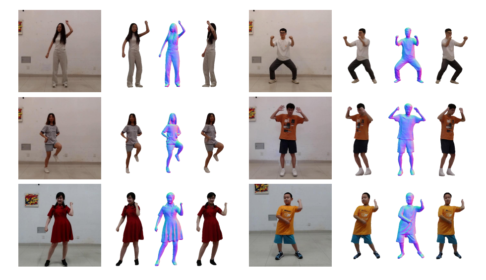
Figure 4: Examples of the results on the real captured images by our system.