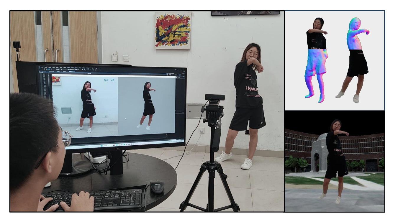
Figure 1: Our system achieves real-time high-quality 3D human reconstruction and rendering with a single RGB camera at 28+ FPS and exhibits an end-to-end latency of 75ms. It can be applied to 3D holographic displays and virtual reality environments.

Kun Li<sup>†</sup> Tianjin University China lik@tju.edu.cn