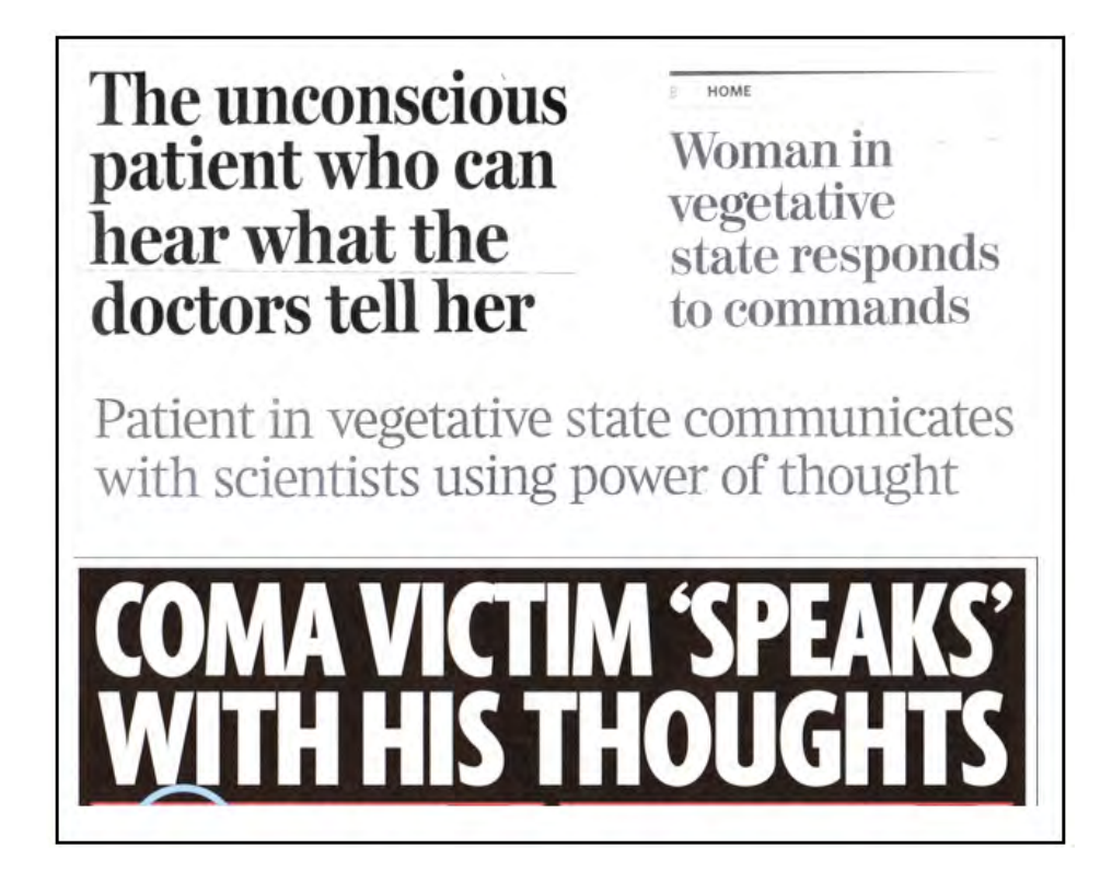
Figure 1: Headlines: top left: Mail 2006; top right: Independent 2006; middle: The Times 2010; bottom: Mirror 2010

interviewees' opinions about the pros and cons of fMRI; and the way they spoke about 'hope'. In the interests of confidentiality, all names used in this article have been changed to pseudonyms. Some other identifying details have also been altered.