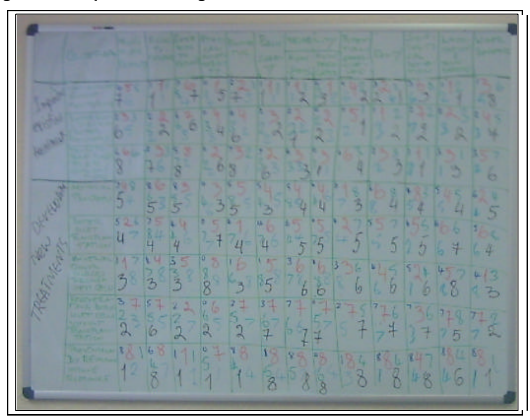
Figure 3: Composite Ranking Table

As noted above, each participant in the focus group stage completed the ranking table twice. In the first focus group meeting, we asked participants about their knowledge of new genetic technologies and of diabetes and its treatments. We then asked them to fill in the ranking table individually and then, when they had done this, transferred their individual scores onto an integrated table (see Figure 3). As expected, the rankings produced by different participants often varied significantly and these differences and similarities then formed the basis of a lively discussion that included topics such as: the participants' experiences of filling in the table (e.g. how difficult or easy different criteria were to apply); the issues they saw as being more or less important; the evidence or experience used to make judgements; and the different reasons given for their decisions.