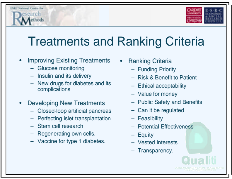
Figure 1: Treatment pathways and ranking criteria

These two lists, which were supplemented by a review of the related literature, then informed the second stage of the research in which we organised focus group discussions to evaluate the different treatment options against the range of criteria identified. Both the treatments pathways and the criteria on which they were to be evaluated are summarised in Figure 1.