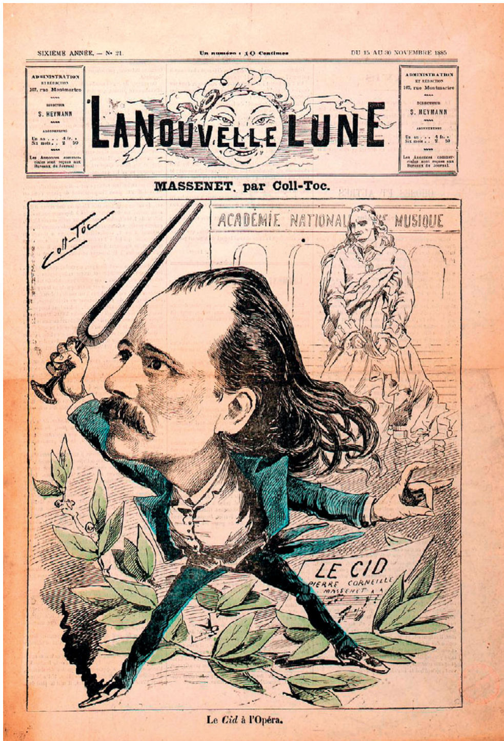
Fig. 7: (colour online) Coll-Toc, 'Le Cid à L'Opéra', La Nouvelle Lune , 15–30 November 1885