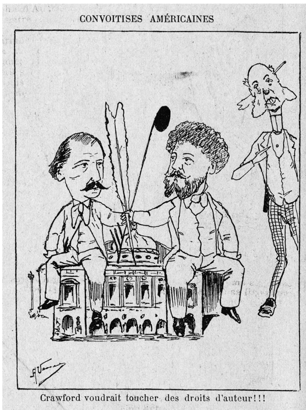
Fig. 9: A.V., 'Convoitises américaines', Le Triboulet , 14e année, no. 12, 22 March 1891, 10