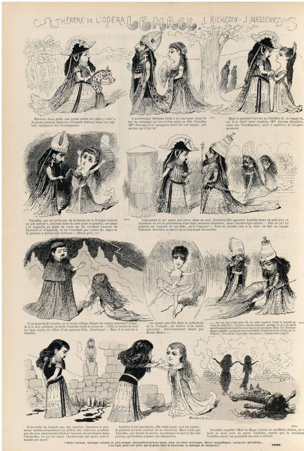
Fig. 1: Stop, 'Théâtre de L'Opéra. Le Mage ', Le Journal amusant , 44 e année, no. 1806, 11 April 1891, 4