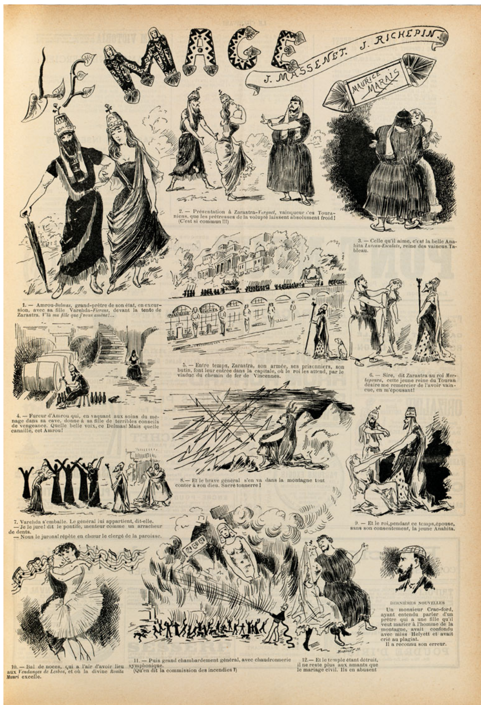
Fig. 4: Maurice Marais, 'Le Mage', Le Charivari , 60e année, 28 March 1891, 3