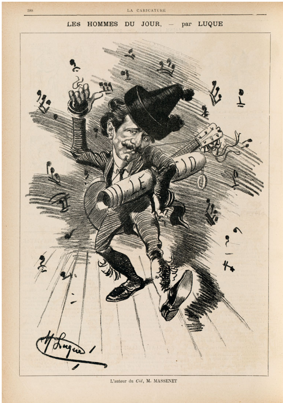
Fig. 5: Manuel Luque, 'Les Hommes du Jour. L'auteur du Cid , M. Massenet', La Caricature , no. 310, 5 December 1885, 388