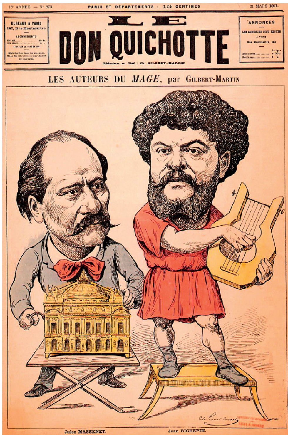
Fig. 8: (colour online) Charles Gilbert-Martin, 'Les Auteurs du Mage', Le Don Quichotte , 18 e année, no. 873, 21 March 1891