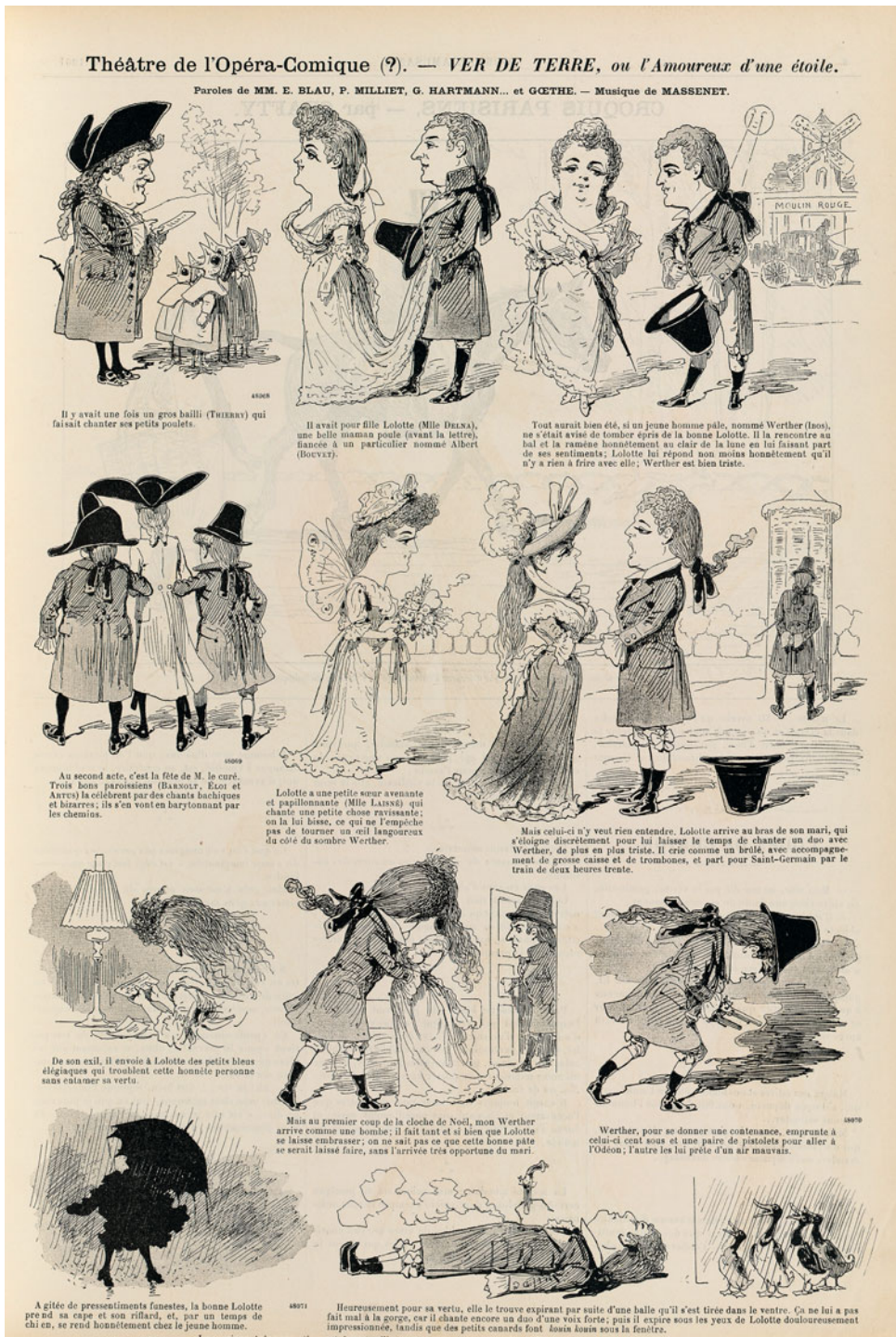
Fig. 2: Stop, 'Théâtre de l'Opéra-Comique (?). — Ver de Terre, ou l'Amoureux d'une étoile ', Le Journal amusant , 46e année, no. 1901, 4 February 1893, 5