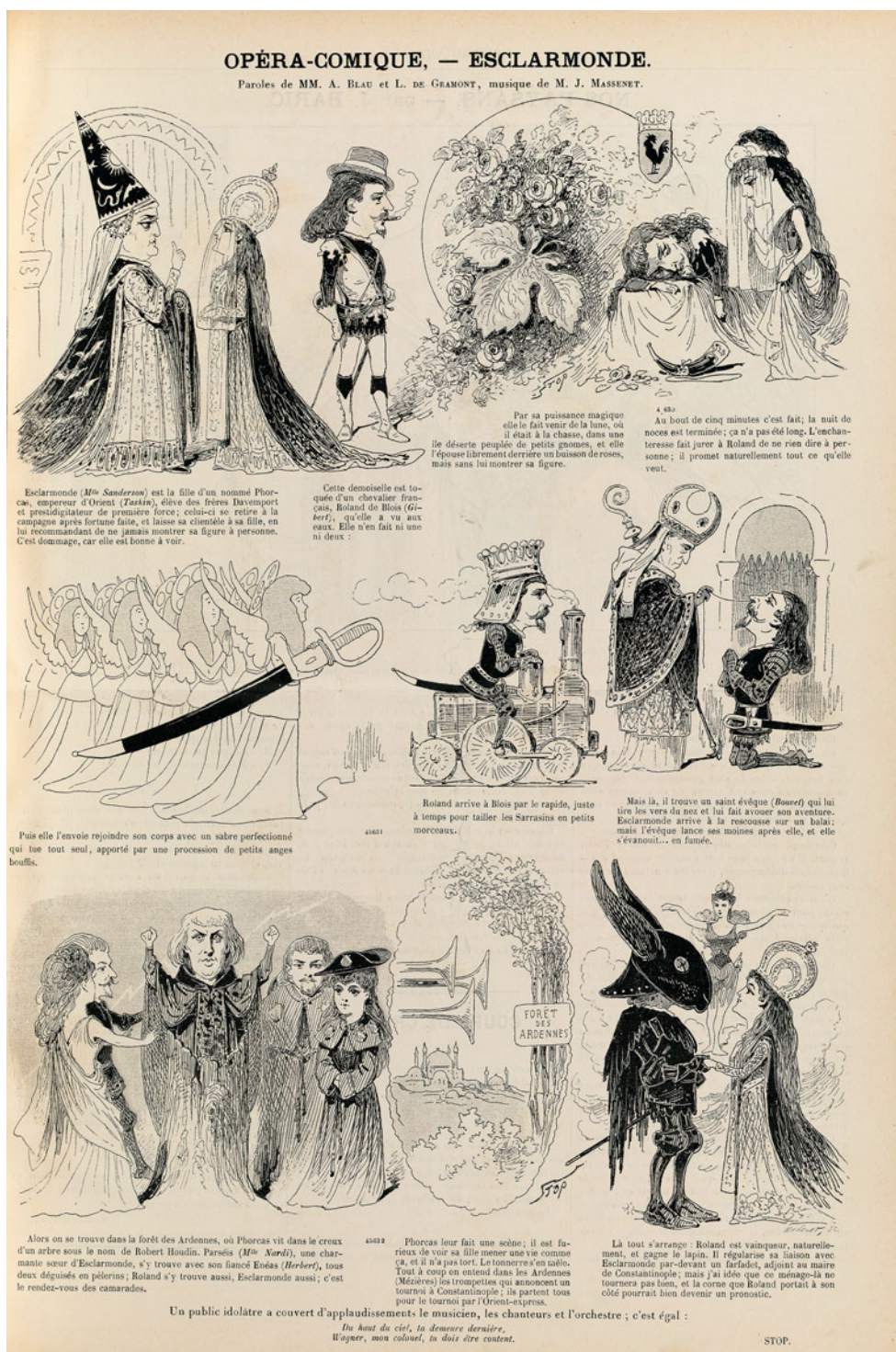
Fig. 3: Stop, 'Opéra-Comique – Esclarmonde ', Le Journal amusant , 43e année, no. 1709, 1 June 1889, 5