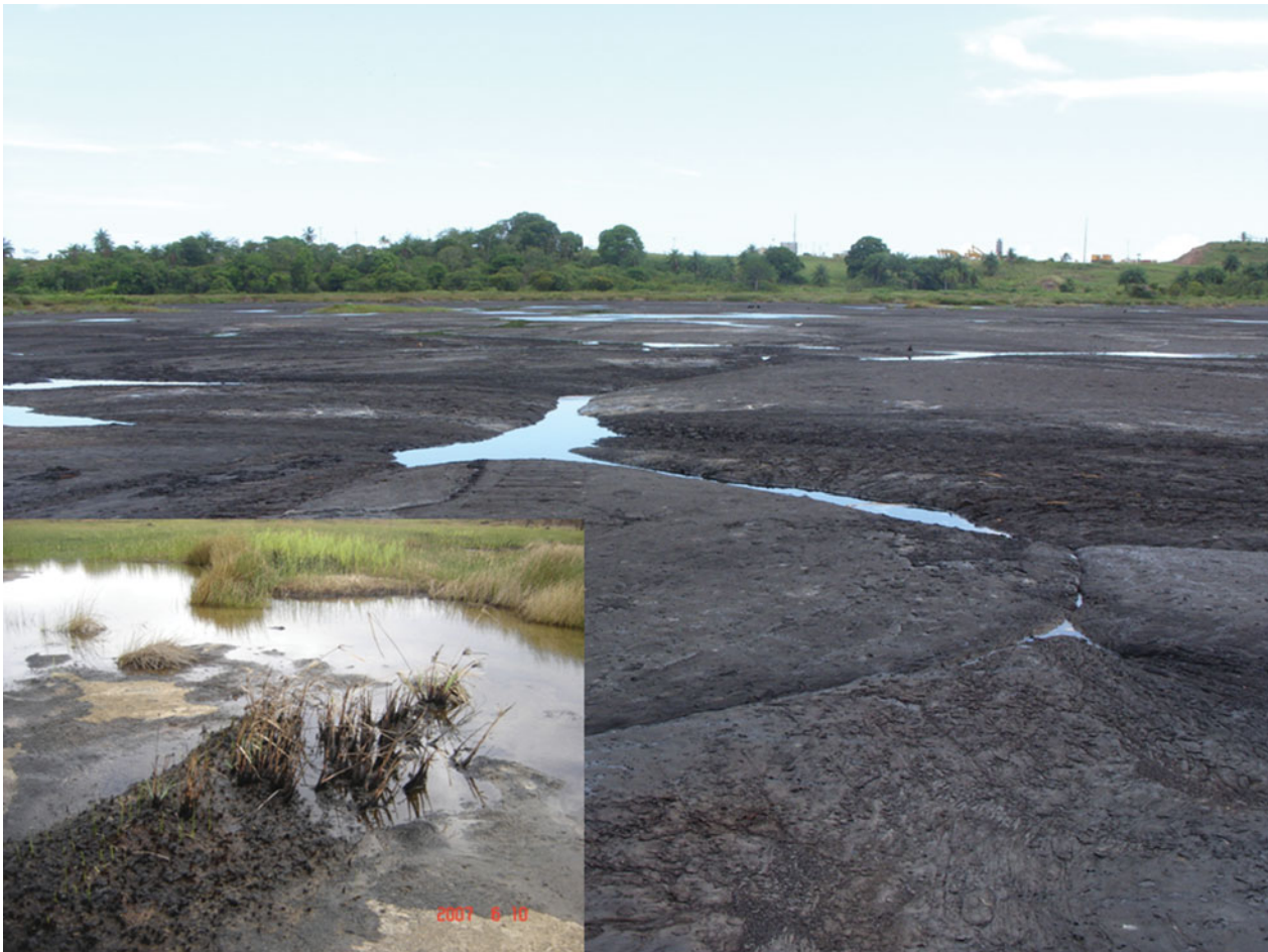
Fig. 1. The Pitch Lake, Trinidad. Insert: a close-up on one of the pools where guppies were collected for this study.

Schulze-Makuch et al. 2010) or on the evolution of species in this habitat (but see Tezuka et al. 2011). Despite its hostile environment, freshwater pools amongst the pitch folds of the encrusted Pitch Lake surface are a habitat for plants (e.g. Nymphaea and Nitella ; personal observations ), bacteria (e.g. Pseudomonas ; see Ali et al. 2006; Schulze-Makuch et al. 2010), invertebrates (e.g. dragon fly larvae, aquatic beetles; personal observations ), the amphibian Pseudis paradoxa ( personal observations ) and fish (e.g. Poecilia reticulata , Rivulus hartii , see Burgess et al. 2005; and Polycentrus schomburgkii , personal observations ).