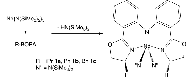
Scheme 1 Preparation of [Nd(R-BOPA){N(SiMe<sub>3</sub>)<sub>2</sub>}<sub>2</sub>] 1a-c.