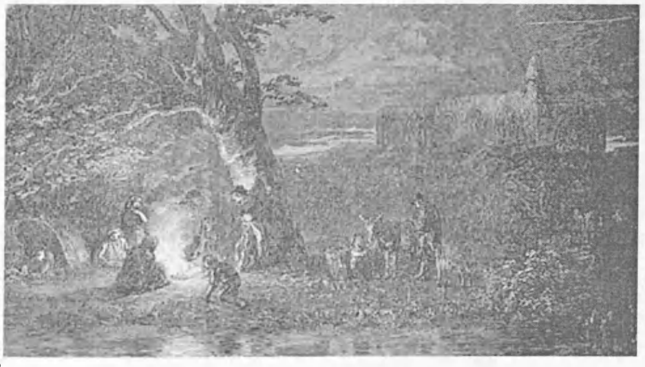
Figure 2 George Haydock Dodgson, Gipsies — Twilight , engraved by Edmund Evans ( ILN , 20 June 1857, p. 610).

Figure 1 Frederick Goodall, A Gipsy Family of Three Generations , engraved by George Dalziel ( ILN , 12 February 1848, p. 87).