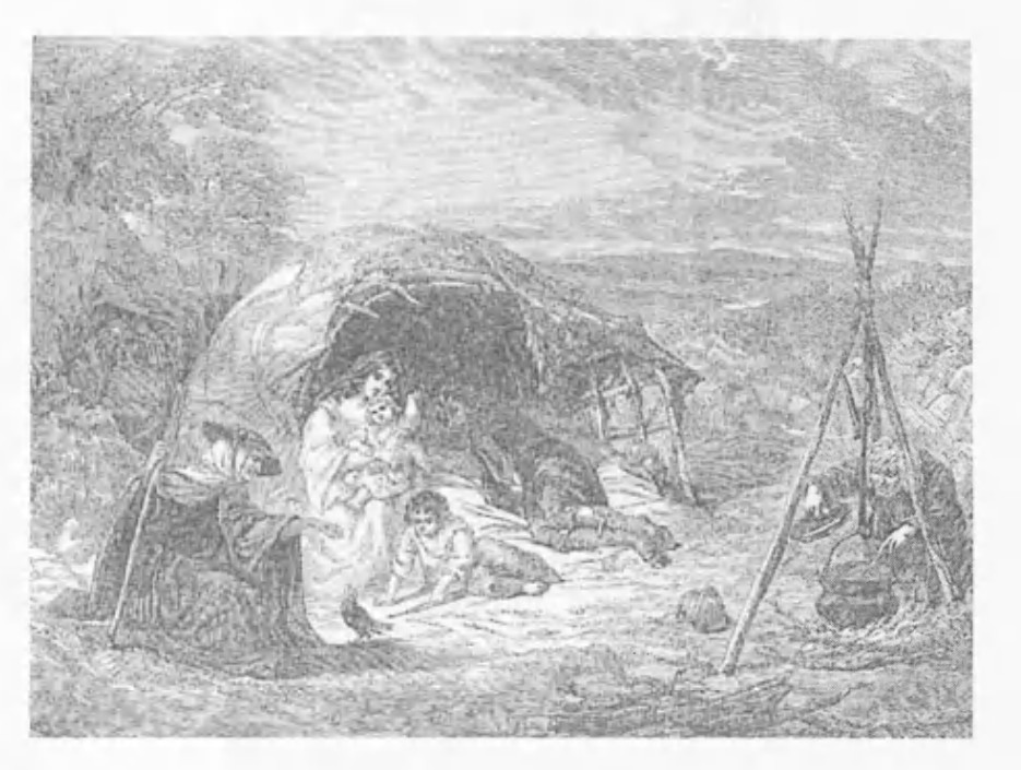
Figure 1 Frederick Goodall, A Gipsy Family of Three Generations , engraved by George Dalziel ( ILN , 12 February 1848, p. 87).