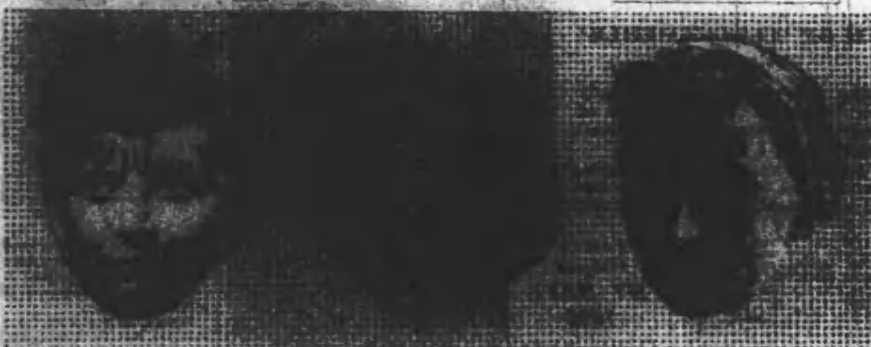
RUTH ELLIS... The model... the mother... the girl who liked motorcars