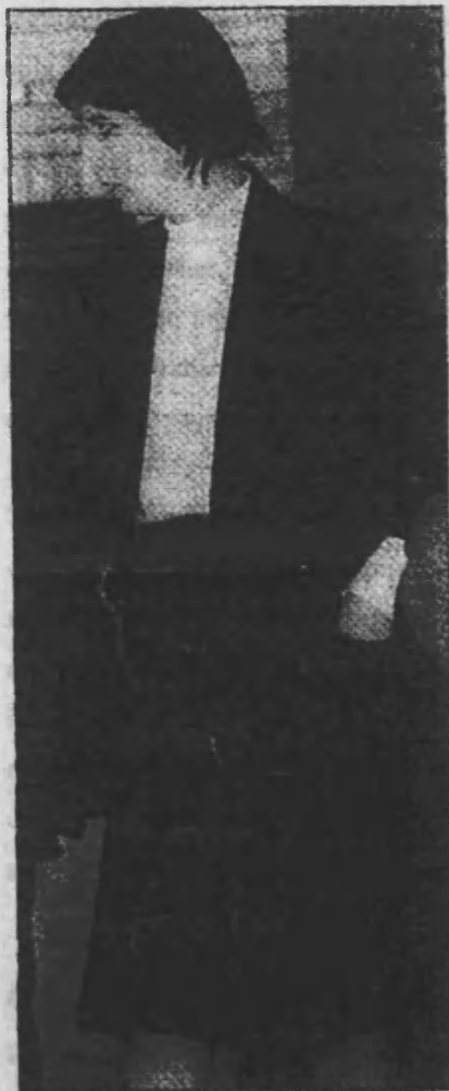
TORTURED: Mrs Line yesterday

The study of descriptions of the Lineburgs supports the findings of the narrative