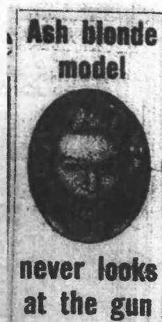
Fig. 6: Ruth Ellis ( Daily Express April 29 th , p.1, 1955)