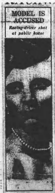
Fig. 4: Ruth Ellis ( Daily Express April 21 st , p.1, 1955)