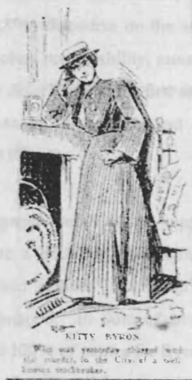
Fig. 1: Emma 'Kitty' Byron ( Daily Express , November 12 th , p.6, 1902)