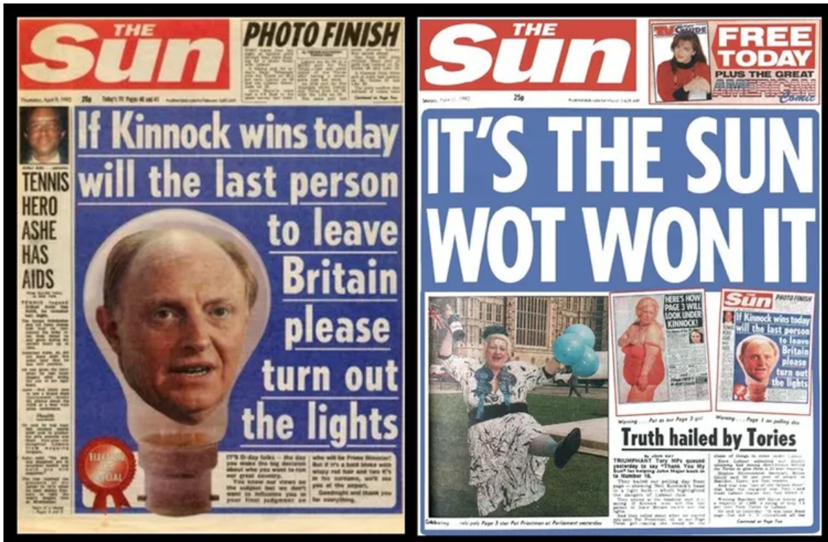
How The Sun 'won it'.

Perhaps there are parallels between Miliband and Kinnock when we consider the refusal of the Sun, in particular, to take Kinnock seriously. In the run up to the 1992 election the Sun asked a psychic to contact dead celebrities and ask them who they would vote for. Under the headline: “WHY I’M BACKING KINNOCK, BY STALIN” the readers learned that Uncle Joe was joined by comrades Mao and Trotsky.