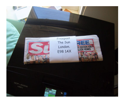
In yer face.

So why was the media so eager to run with a story that was neither confirmed nor denied by The Sun itself? The answer probably lies in the inexhaustible thirst for new stories and angles in a culture of 24-hour news. In our speeded-up world, news organisations never sleep — narratives are updated hourly and the desire for an immediate response to events inevitably means occasional inaccuracies. Put simply, there is an incredible amount of pressure on journalists to react and produce more copy, more frequently.