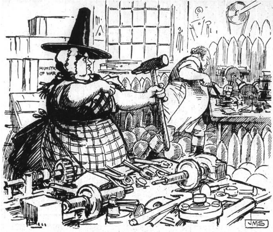
Figure 1: J.M. Staniforth, A Willing Worker , May 1915

The cartoon itself however does reinforce the idea that making munitions was an entirely patriotic act in order to ‘smash them old wicked Germans!’ and coincides with appeals in the press towards Welsh patriotism as a means of recruiting men for the military. The representation of Welsh wartime patriotism was often expressed with references to past military triumphs. Both the Conservative and Liberal press believed that drawing on ideas of Welsh patriotism in this manner was an effective way of encouraging men to enlist. 53 Commentators approached the war as a ‘heroic’ struggle against Germany with military service portrayed as a ‘privileged duty’ for the king and