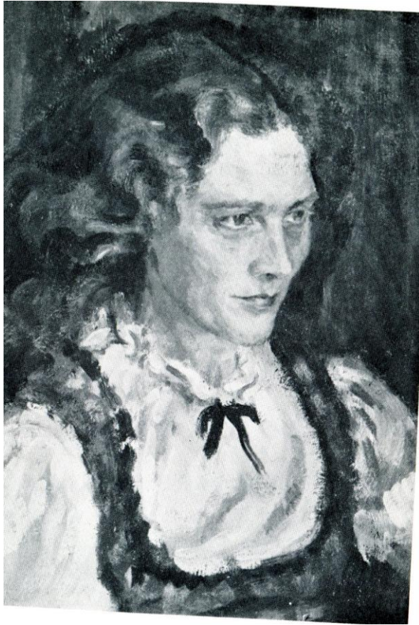
Figure 7: Painting of Hilda Vaughan. 96

She directly associated the drudgery of women's farm work with the sacrifices made by men at the front. 'I am putting before you the disadvantages of the life. Long Hours! Hard work! Poor pay! After you get your board and lodging, a shilling a day perhaps [...] but girls the Royal Welch Fusiliers and the Welch Regiment [sic] are offering their lives for that. Will you not offer your services for that – for them?' 97 Her explicit reference to Welsh regiments reinforced the responsibility women had to help their own friends and family serving in those regiments.