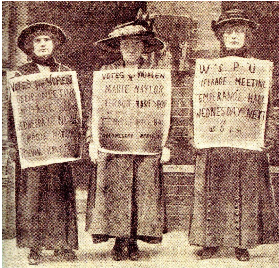
Figure 5: Margaret Haig Mackworth (on left) parading in the streets of Newport in 1913. 117

In February 1917, Margaret Haig Mackworth became commissioner for Wales and Monmouthshire in the Women's Department of the Ministry of National Service. Although the department faced initial difficulties and opposition from the Ministry of Labour, especially in relation to the commissioners' responsibilities, Mackworth