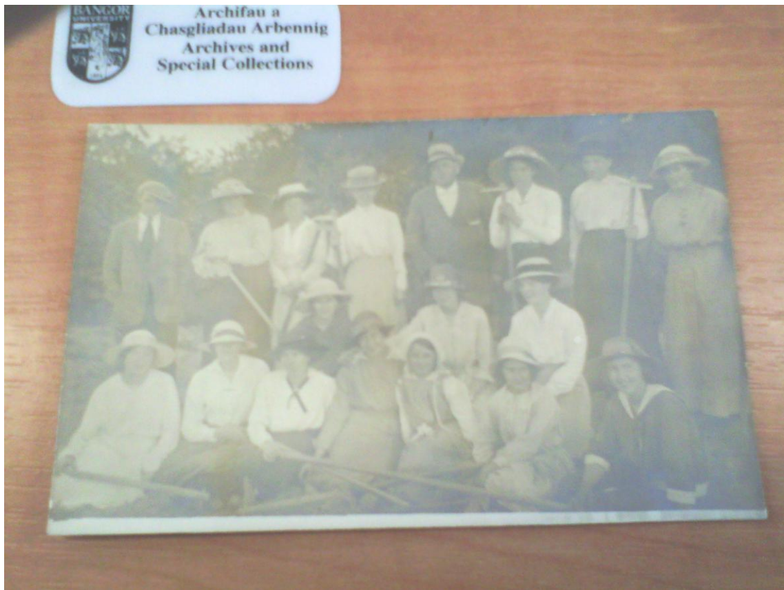
Figure 6: ‘Women’s Land Army, Montgomeryshire, c. 1917’

shows a group of non-conscripted men and boys alongside women working as part of a ‘village gang’ somewhere in Montgomeryshire during 1917. 73