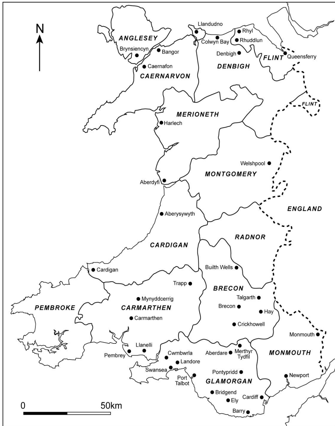
The counties of Wales (to 1973) 1