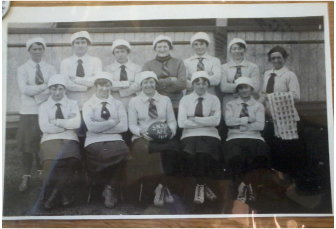
Figure 8: Swansea National Shell Factory Football Team, 1914-1918

Interest in women's football was stimulated by their wartime role and the money which could be raised for wartime charities. Managers or senior male employees of individual factories often coached such teams, with female welfare supervisors often on hand to give guidance and encouragement to the players. 113 Furthermore, it caught the attention of the local press bringing into sharp focus attitudes towards gender and class, alongside the relationship between women playing football and the importance of raising money for wartime charities and keeping a fit and healthy workforce.