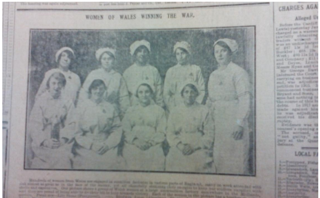
Figure 4: ‘Women Of Wales Winning The War’

Such descriptions made it socially acceptable for women to appear in traditionally masculine roles. In addition, to reduce the threat posed by women stepping outside the normal boundaries imposed by their class and sex, the local press emphasised that women’s work was for the duration of the war only. 88 The idea that female employment was temporary was subtly reinforced by wartime advertising printed in both the local and national press. The producers of Sunlight Soap, the Lever Brothers, highlighted the replacement of male by female workers in one advertisement printed in the Western Mail , which presented a soldier and female worker shaking hands. 89 The reproduction of such images was one way in which newspapers acted as unofficial recruiting agents. In south Wales, labour exchanges were put under enormous pressure to develop and strengthen recruitment campaigns to get more female labour