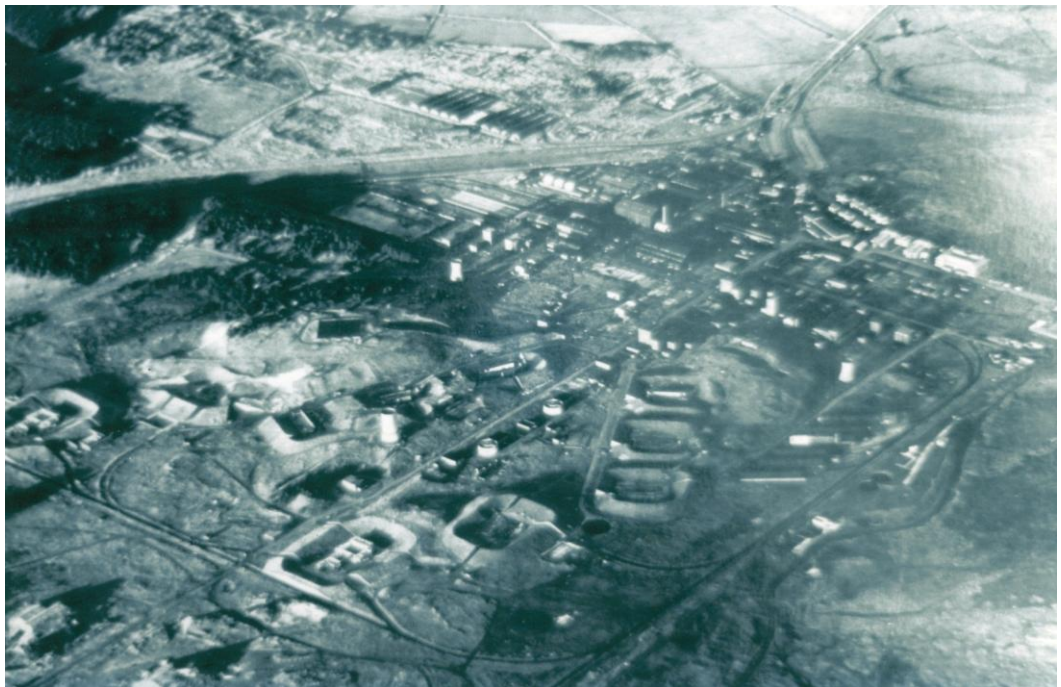
Figure 8: Royal Ordnance Factory at Pembrey, Carmarthenshire, c. 1950