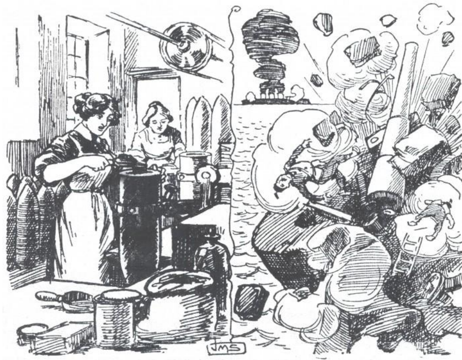
Figure 2: J.M Staniforth, ‘For King and Country’, March 1915

state. 54 Newspaper depictions of women workers fed into these narratives. Depictions of war work printed in the traditionally conservative Western Mail conveyed the role of British women. Under a cartoon, produced again by Staniforth, with the headline ‘For King and Country’, the caption from ‘our leader’ proclaimed that ‘The British woman-worker at home who fills the shells, Helps to destroy the Turkish forts on the Dardanelles’ (see image below). 55