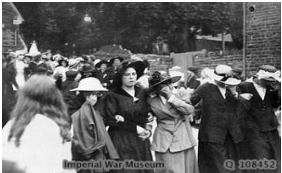
Figure 7: Female munitions workers attending the funeral in Swansea of a colleague killed in an explosion at an unknown factory, August 1917.