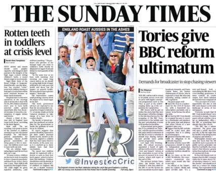
Campaigning front page from Sunday Times.

According to a front-page report in the Sunday Times headlined: “Tories give BBC reform ultimatum” the Green Paper will, among other things, urge the ditching of the BBC Trust (which is responsible for governance), question impartiality and discuss whether production facilities should be privatised.