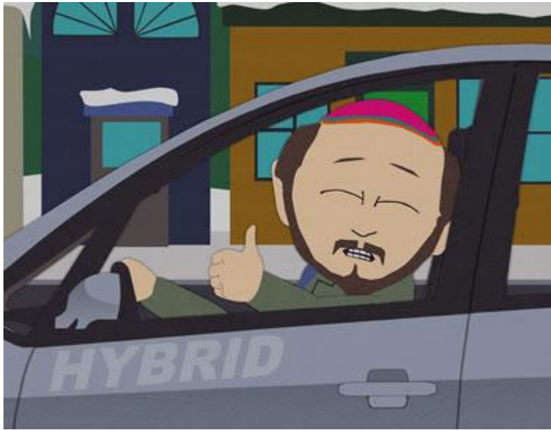
South Park mocks the electric car driver: Gerald in his Toyonda Pious.

In a short time, becoming completely carried away with his new eco-warrior persona, Gerald decides that his current levels of commitment are not sufficient to the cause so he initiates a campaign intended to convert other residents to take up more environmentally friendly vehicles. As part of this, he cruises around the town looking for internal combustion engines and issuing the owner a 'ticket for driving a gas-guzzler'. However, this mission is less than successful and Gerald proceeds to irritate and frustrate his former friends. Annoyed at the fug of self-satisfaction emitted by Gerald, he is dismissed with the retort that, 'ever since you got a hybrid car, you've gotten so smug that you love the smell of your own farts'. After deciding that he can no longer bear to live among such 'backward and unsophisticated' people, Gerald moves his family to that supposed hotbed of liberal progressiveness San Francisco (which the writers clearly selected as a city whose residents apparently have a far too high an opinion of themselves).