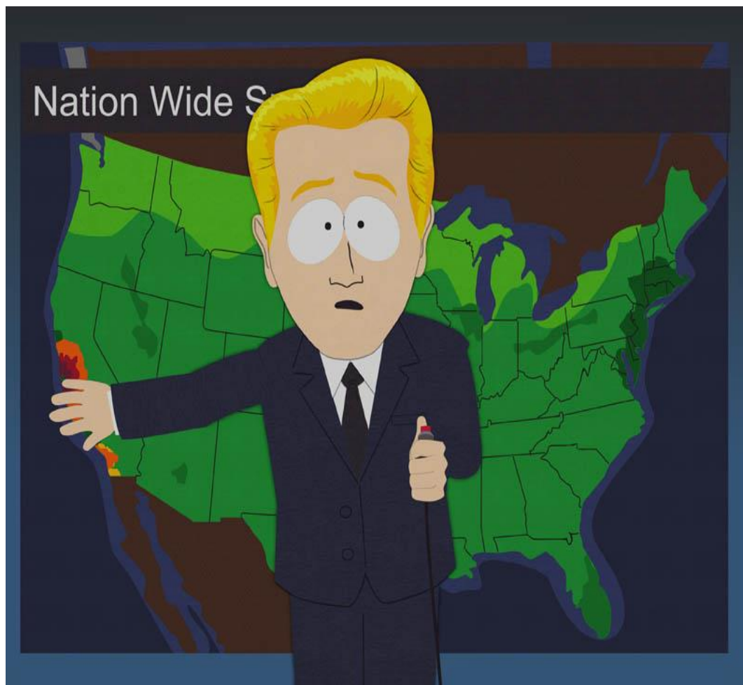
The smug heads for South Park: panic as San Francisco's smug problem escalates.

After the family leave, the sad and lonely best friend of Gerald's son decides to pen a song praising the virtues of electric vehicles. Kyle supposes that, if everyone in South Park abandons internal combustion engines, Gerald will return with his son in tow. The song is broadcast on a local radio station where its central message proves to be so powerful that it convinces everyone in town to drive hybrids. On his way home from the radio station, the boy meets Ranger McFriendly, local protector of the environment, who, with great concern, explains the disastrous consequences of his actions. While emission levels from internal combustion engine car exhausts have fallen, they have been replaced by a new pollutant – this time borne of the 'self-satisfied garbage' spewed by the drivers of hybrid cars.