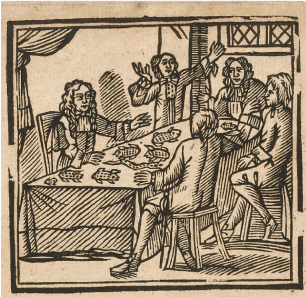
Image of a naturalists' meeting from the contemporary Douce Ballads 2 (c.1672-1696). It is used to illustrate a sexist moral ballad called 'The scolding wife' but almost certainly recycled from elsewhere.

Image is believed to be in the public domain due to its age. Go histoggggsee the amazing comic adaptation of this illustration on Hark a Vagrant .