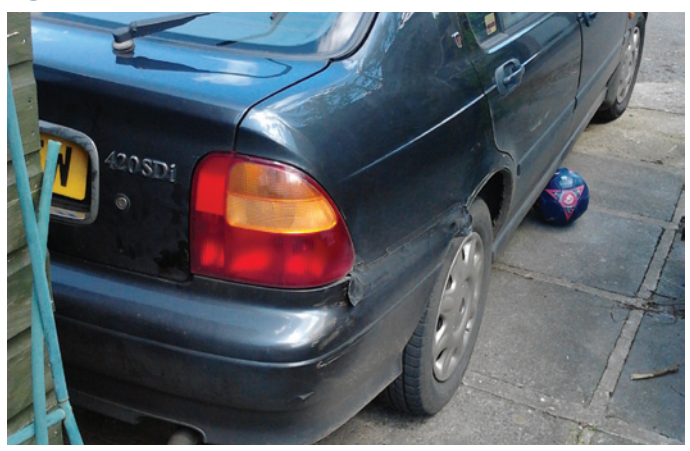
Figure 5 Jonathan's car

In the next section, 'Living worthwhile lives', we discuss these themes in more detail.