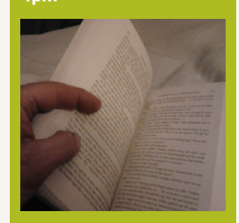
Reading a book