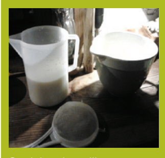
Straining the milk