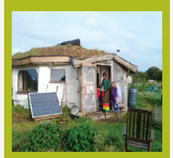
Dropping my daughter off