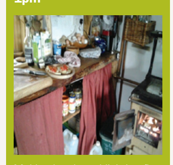
Making lunch and lighting fire