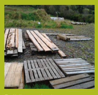
Building a she