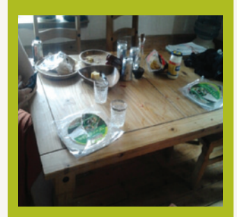
Tidving up after lunch