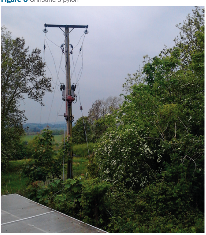
Figure 3 Christine's pylon

We're surrounded by beautiful scenery, really is beautiful scenery until you look out of one window and there's a huge, big electric pylon there ( Christine, Ely )