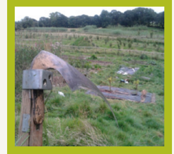
Planting fruit bushes/scvthing