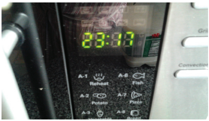
Figure 4 Jack's microwave

At the same time, however, an important finding was that many people drew on publicly-available concepts of energy efficiency and demand reduction to talk about their relationship with energy. In other words, for many interviewees, their dependence on infrastructure in the home in particular is often visible or tangible to them, and may be a source of agitation where they are conscious of what they consider to be 'excessive' energy use, particularly where money is tight and other priorities are pressing. Awareness of using too much energy can motivate action to change things, making possible forms of agency which can be the source of a sense of achievement.