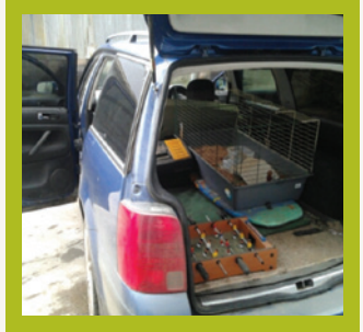
Loading up the car