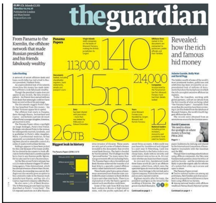
How reported the Panama Papers.

there is a view that public interest investigative journalism increasingly has to be carried out by non-corporate media.