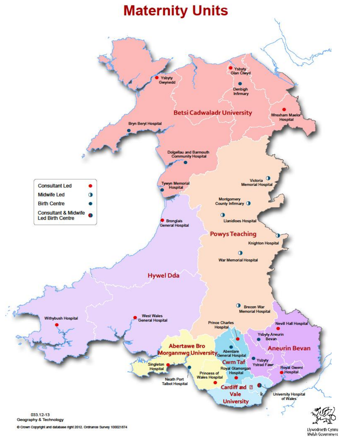
Figure 5.1 Map of Maternity Facilities across Wales