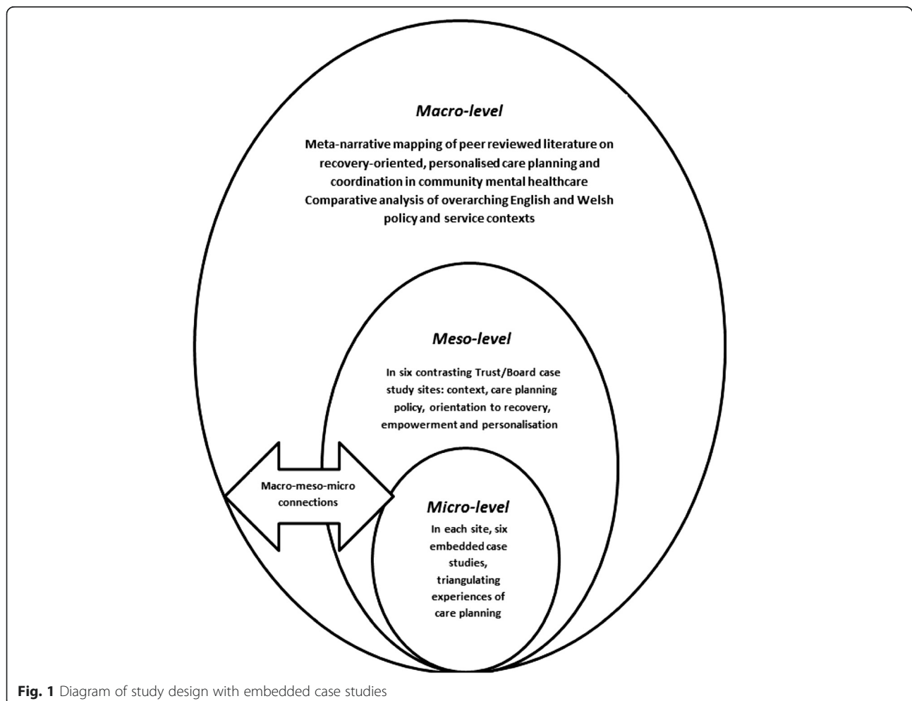
Fig. 1 Diagram of study design with embedded case studies

Access was secured to six National Health Service (NHS) organisations providing mental health care: four Trusts in England (pseudonymously referred to as ‘Artois’, ‘Dauphine’, ‘Languedoc’ and ‘Provence’) and two Local Health Boards (LHBs) in Wales (‘Burgundy’ and ‘Champagne’). Sites were selected to reflect geographical, population and urban/rural diversity (see Table 1). With help from local collaborators and research support staff, access was secured to 20 community mental health teams (CMHTs) across the six sites, with one specific team within each of these sites identified for in-depth case studies. In the UK CMHTs are the main vehicles for the local provision of secondary mental health care, and are typically funded by NHS and local authority organisations and staffed by health and social care workers, including psychiatrists, mental health nurses, occupational therapists, psychologists and social workers. Sampling criteria for CMHTs included the routine provision of care to adults, having a team manager in post and not being scheduled for merger or closure.