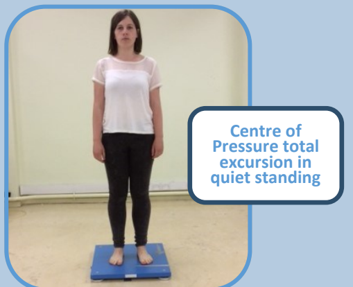
Centre of Pressure total excursion in quiet standing

After height normalization (HN) all measures had a lower level of correlation with HN-MTBRT. HN-MTBRT was significantly, but only moderately correlated to HN-LRT ( r=0.501 , p=0.024 ). There was no significant relationship between HN-MTBRT and HN-FRT ( r=0.172 , p=0.468 ) or HN-MTBRT and COPotex ( r=-0.133 , p=0.575 ).