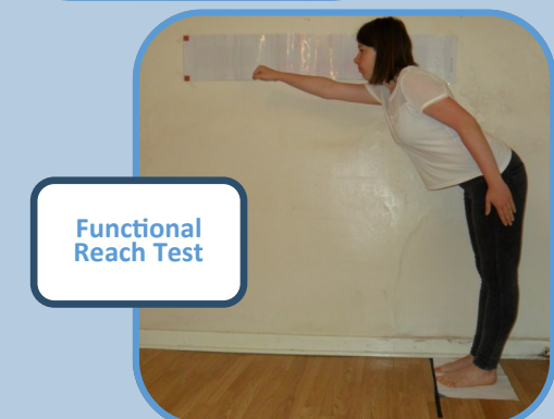
Functional Reach Test

MTBRT can be a useful tool to assess physical performance changes. Limitations of this study were the small sample size and young population which prevents generalisation to older populations. More research with bigger sample sizes and an older study population are needed.