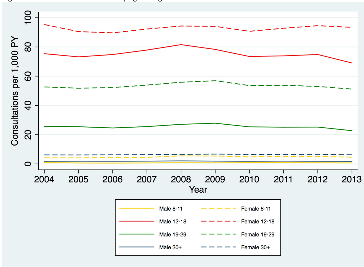
Figure 2: Oral acne related medication prescribing: 2004 – 2013