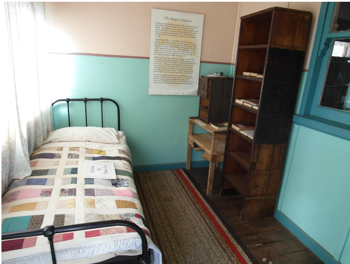
Figure 2 Photograph of Miner's Cottage, Western Australian Museum