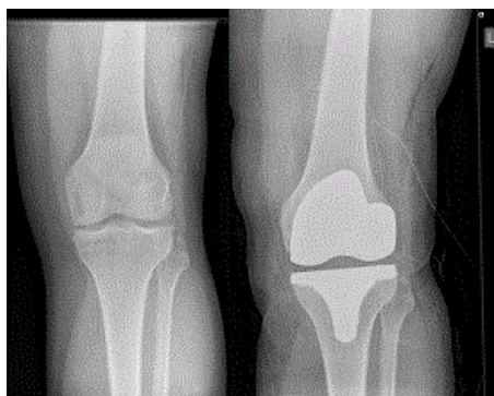
Figure 1: Patient's left knee radiographs pre and immediately post operation

A 59 year old male with a medical history of hypertension, non-insulin dependent diabetes mellitus, angina and benign prostatic hyperplasia whom underwent simultaneous bilateral primary total knee arthroplasty surgery for osteoarthritis (Figure 1). The patient received Atracurium 50 mg IV at the induction of general anaesthesia for muscle relaxant purposes.