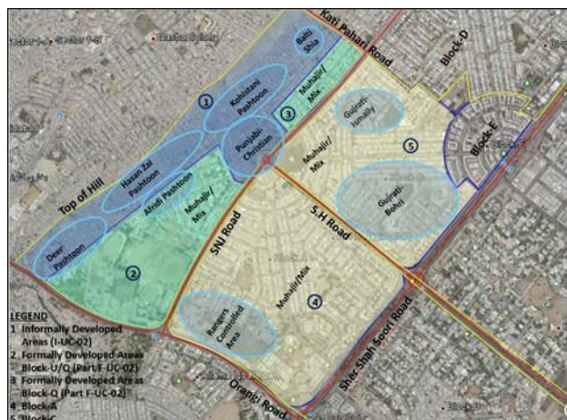
Figure 2: Ethno-religious enclaves in North Nazimabad

The informal areas were originally squatted, and although now mostly titled and no longer technically informal, they remain distinct in many ways. The formal area has remained peaceful, but the western zone on the boundary with Orangi Town has been the focus of Pashtoon-Muhajir conflicts since the mid-1980s, as it forms a border between Muhajir and Pashtoon strongholds 54 . The violence increased during 2007-2013, especially after the new road opened, and the Kati Pahari area is now one of the most violent flashpoints in the city 55 . During 2011-2012, SNJ Road Police Station registered 35 political killings,