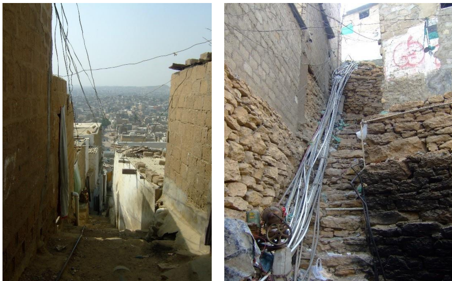
Figures 3: Winding street pattern and illicit water and electricity connections in Chamra Chum, North Nazimabad

In the informal areas, especially on the hill, the electricity company representatives did not repair faults or disconnect illegal connections because of the difficult terrain and threats to company employees. Thus, most residents on the hill had illegal electricity connections and did not pay their bills. To recover the costs of illegal connections, the company distributed the cost of power losses to all paying customers.